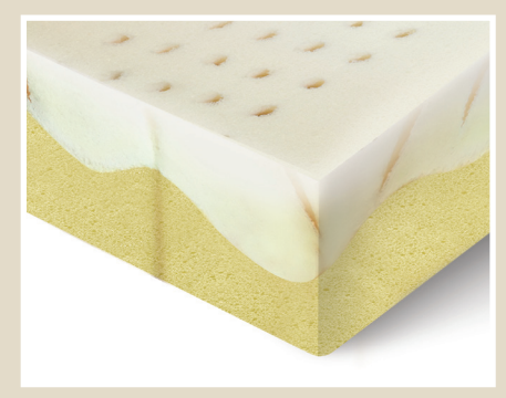
Fused Latex & Memory Foam

The Fused Latex & Memory Foam is produced by fusing a layer of memory foam with a layer of latex foam. This process creates a single piece of hybrid foam, with an unique and consistent feel, while retaining the benefits of both memory and latex foams